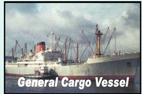
General Cargo Vessel